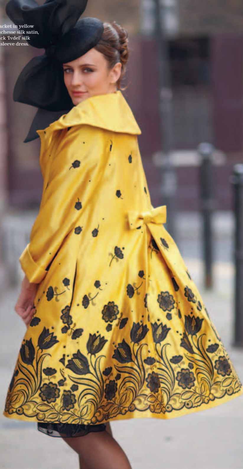
'Washington' jacket in yellow 'Christopol' duchesse silk satin, worn with black 'Ivdel' silk organza short sleeve dress.