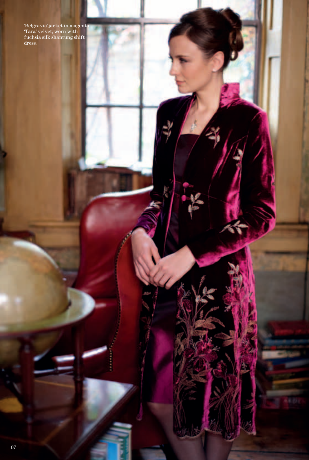
'Belgravia' jacket in magenta 'Tara' velvet, worn with fuchsia silk shantung shift dress.