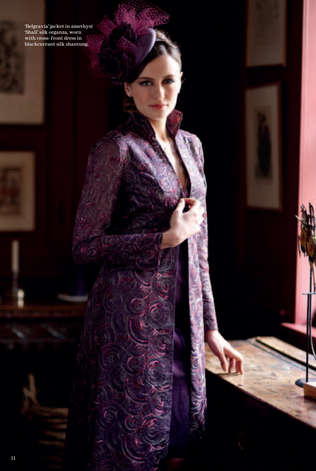
'Belgravia' jacket in amethyst 'Shali' silk organza, worn with cross-front dress in blackcurrant silk shantung.